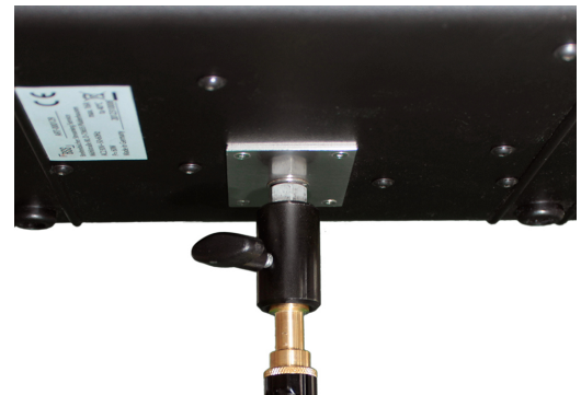
Case with spigot adapter (not included) mounted on a tripod