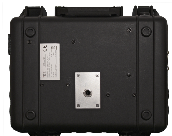
Case with 3/8 inch thread insert at the bottom of the case